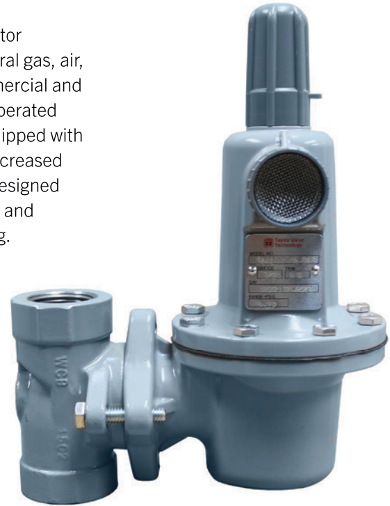
Flow Capacities, scfh of 0.6 Specific Gravity Gas, Based on 20% Droop

The model 5646C pressure regulator provides economic control of natural gas, air, or a variety of other gases in commercial and industrial applications. This self-operated pressure reducing regulator is equipped with an integral pitot (boost) tube for increased flow capacities and stability. It is designed for inlet pressures up to 1000 psig and outlet pressures from 5 to 200 psig.